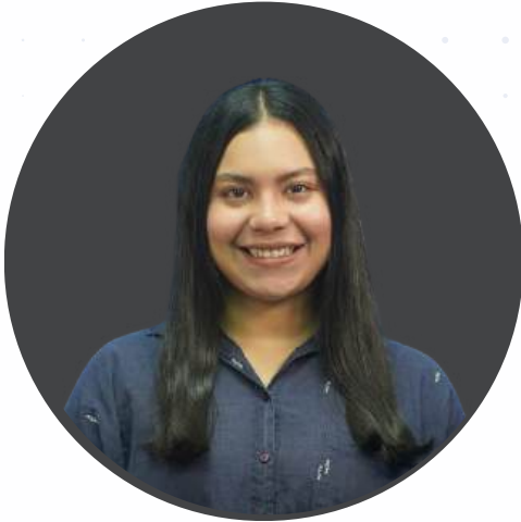
Carol Rico Nursery