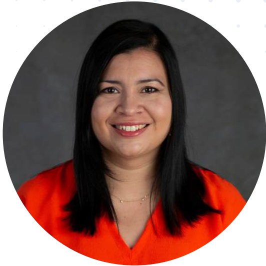
Moncerrat Lagos Kindergarten